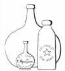
LAHBC Est. 1966